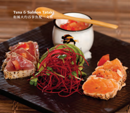
Tuna & Salmon Tataki 和風火灼吞拿魚配三文魚