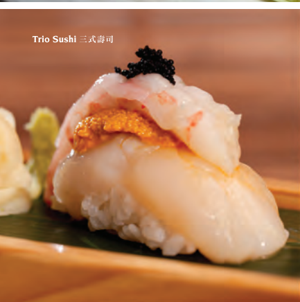
Trio Sushi 三式壽司