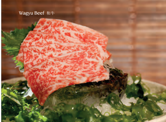
Wagyu Beef 和牛